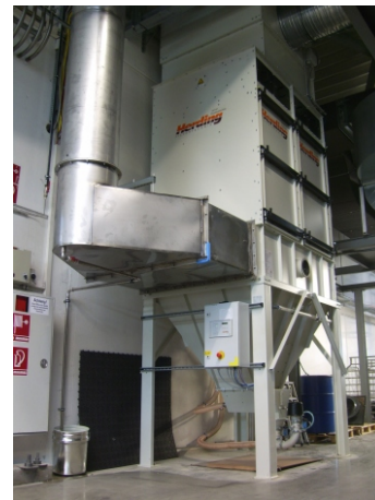
Pic. 2: Herding® filter system