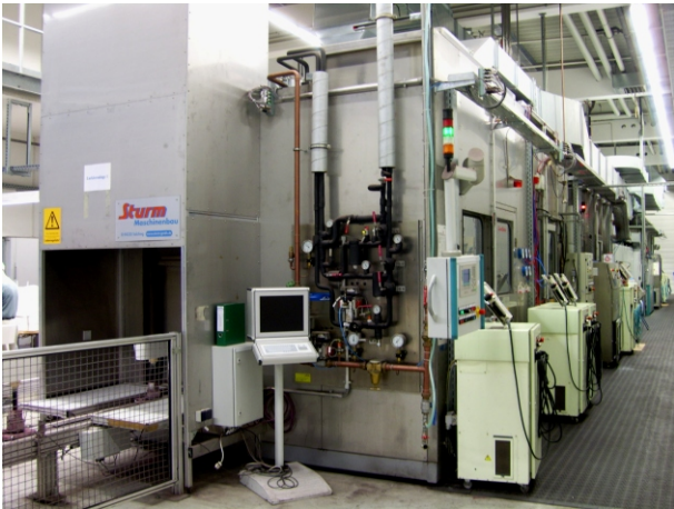
Pic. 1: Dry filtration of UV paint